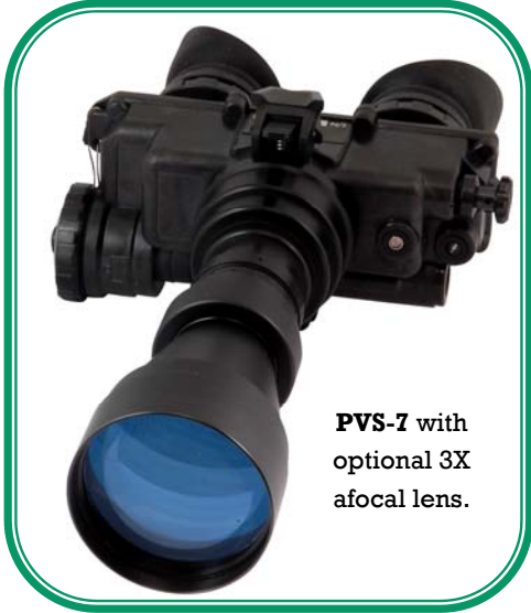
PVS-7 with optional 3X afocal lens.