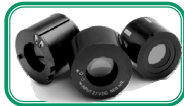
IMAGE INTENSIFIER TUBES FEATURING