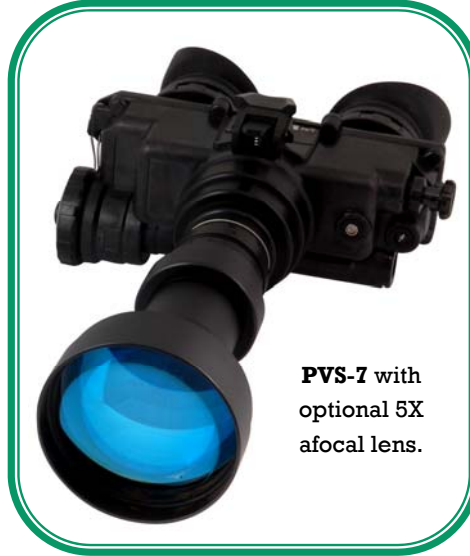
PVS-7 with optional 5X afocal lens.