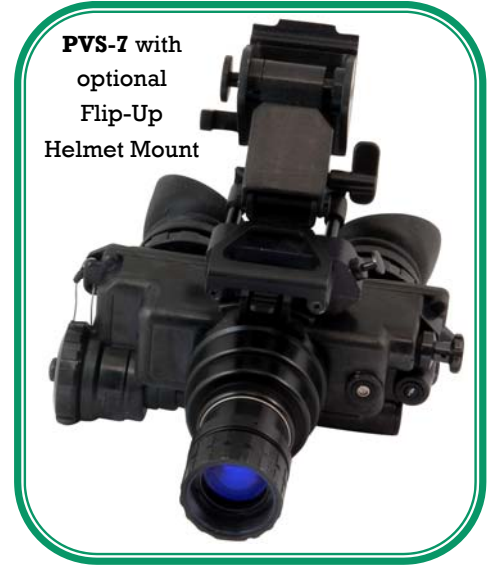
PVS-7 with optional Flip-Up Helmet Mount